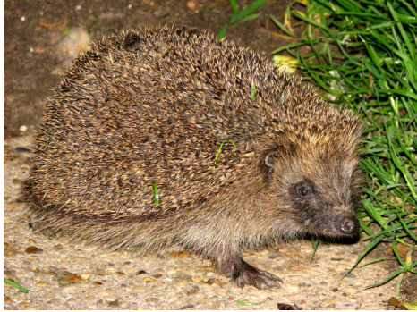
Hedgehog ( Erinaceus europaeus )

Hedgehogs have been part of human culture for thousands of years. Across different societies, they've been symbols of fertility, protection and healing, as well as fear, superstition and suspicion. Today, 17 species of hedgehog are found across Europe, Africa and Asia, many of which live in close proximity to people, a closeness that has helped shape the stories told about them.