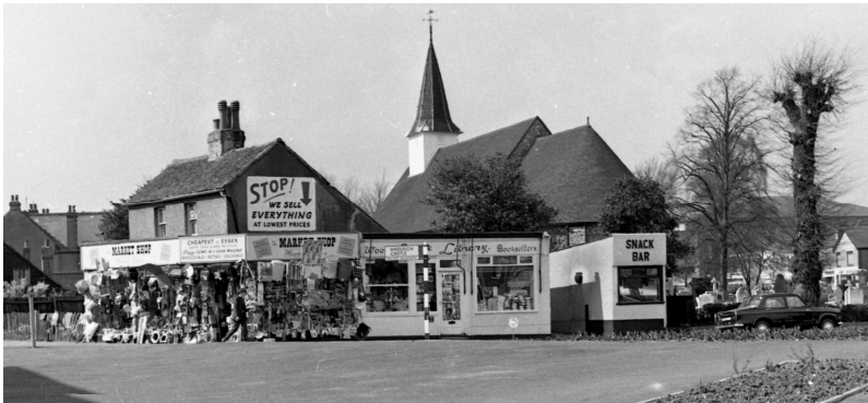
Hadleigh Corner – Mar 1967

Some readers will be aware that the Hadleigh & Thundersley Community Archive group, of which I am a member, has been scanning negatives of images that appeared in the Southend Standard and Echo newspapers from the mid-1960s to the year 2000. A few of the images scanned to date appear below..