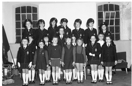
Girls' Brigade at our church – Jan 1970