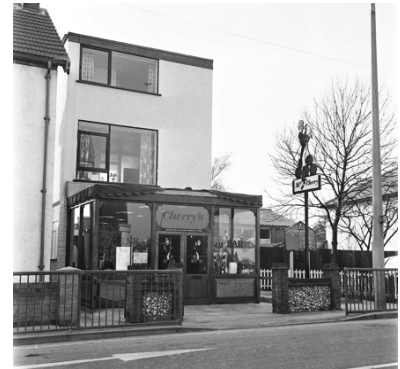
Cherry's (now Fatty's Bar) – Feb 1975