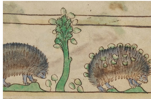
Part of an illustration from around 1250 showing a hedgehog stealing fruit.

Some long-standing myths also persist, with well meaning people offering them milk, despite hedgehogs being lactose intolerant.