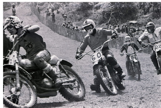
Scrambling on Hadleigh Downs – May 1975