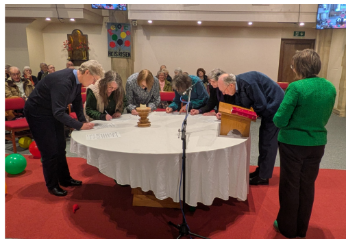
Signing of the Mission Partnership Agreement