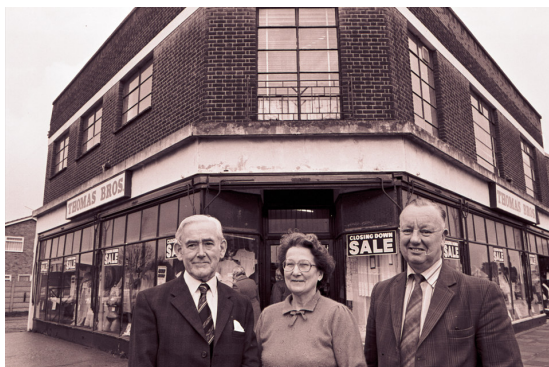
Thomas Brothers closing down sale – Apr 1984